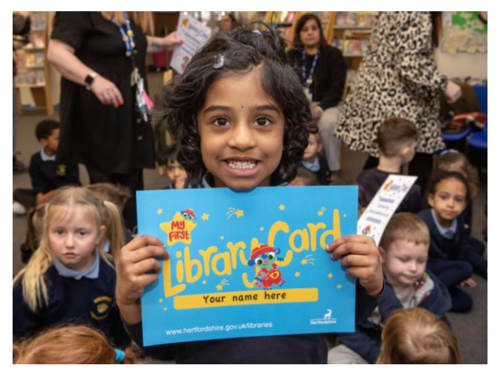
A child on a school visit holding a giant My Firsts library card

My Firsts was launched to encourage 0 - 5 year olds to join the library with attractive materials designed with local emerging artists. My First Library Card features Tala the storyteller, and this, along with a variety of certificates, supports and celebrates milestones in the development of young children at the start of their reading journey.