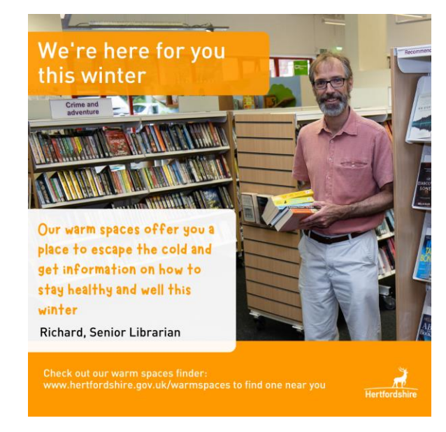
A promotional image for Warm Spaces

Hatfield Library has supported those in greatest need in the local community by partnering with a charity, Resolve, and a local café to provide vouchers for over 5,000 free meals, funded through the Household Support Fund .