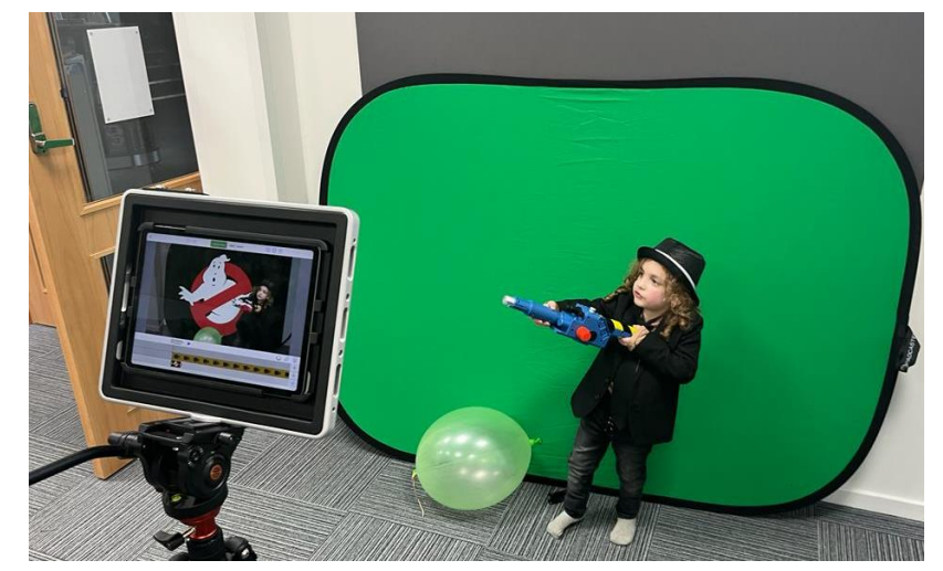
A Hitchin resident has fun with the green screen in the library's new CreatorSpace

We now have 6 dedicated CreatorSpaces in libraries, extending access to innovative and creative technology for all ages.