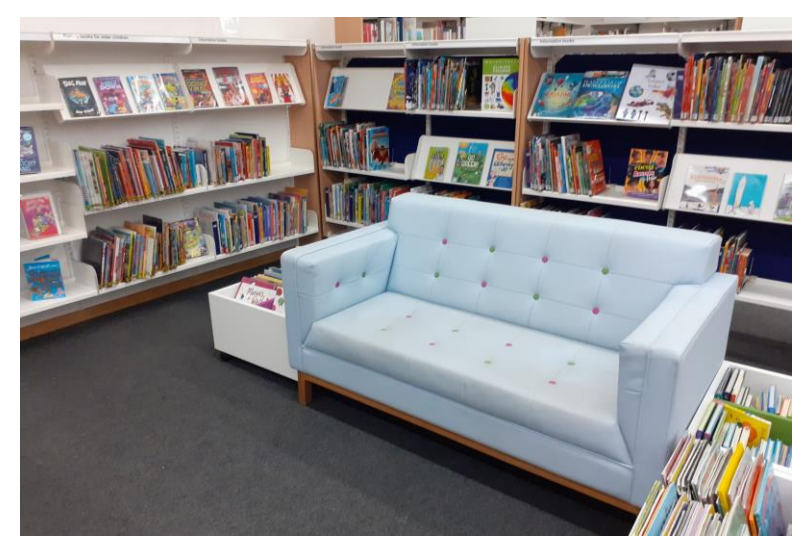
Children's area at Hertford

Upgrades have taken place to improve Open+ swipe card access at Croxley Green and Berkhamsted libraries. Work is underway to roll out this self-service access to additional locations.