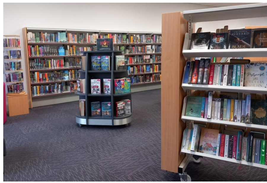
Fiction area at refurbished Radlett Library