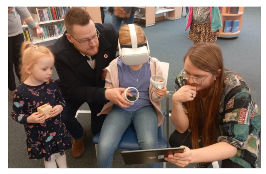
A family enjoy a virtual reality experience at Welwyn Garden City CreatorSpace launch

In response to staff feedback and consultation, we expanded our offer of digital and STEM technologies with additional CreatorSpace Out of the Box resources. These collections enable pop up activities showcasing portable technology and a variety of exciting resources for people of all ages.