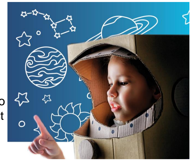
A promotional image designed for the Cosmic Curiosity project

Cosmic Curiosity, an innovative project in partnership with the University of Hertfordshire, delivered Science Technology Engineering and Maths (STEM) sessions for children. Families attended a series of activities in libraries, we created booklists to spark imagination, and also staged events for an adult audience. We were delighted that this project was chosen to receive a national Family Learning Award.