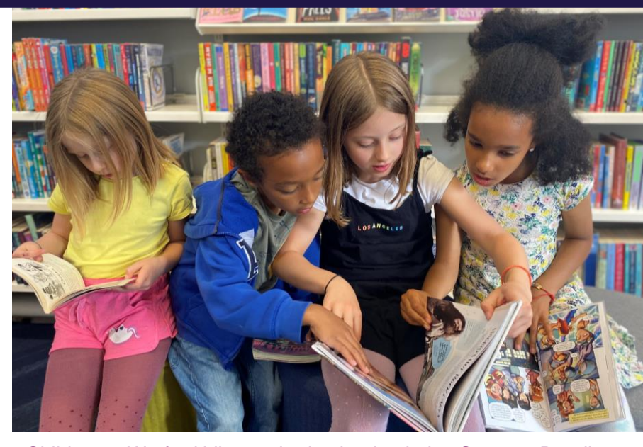
Children at Watford Library sharing books during Summer Reading Challenge 2022