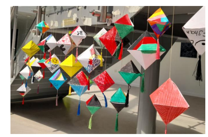
Paper kites created at the summer camp for children from Afghan Refugee families

Libraries collaborated with partners to offer support and a warm welcome to refugees. Hertfordshire Libraries supported a summer camp for children from Afghan Refugee families, gifting books and delivering stimulating creative activities for the young people.