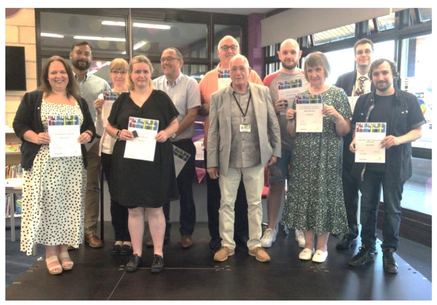
Winners at the inaugural Staff Awards

Thank you to our volunteers of all ages who have supported the library service this year: