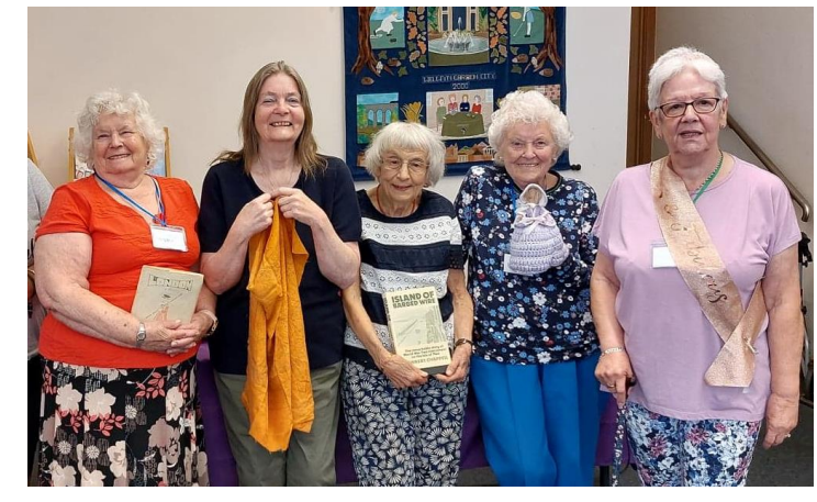
Members of Welwyn Garden City Tuesday Allsorts group share their show and tell items

Libraries organised a wide range of social groups to enable people of all ages to connect with others and reduce loneliness. Groups are tailored to meet the needs within local communities, leading attendees to form friendships and feel at home in the library space.